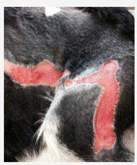
Collasate helped keep the wound clean during healing.