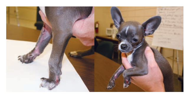
In just five weeks, her front legs were growing new fur!