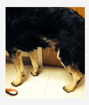
Tybee recovering nicely.