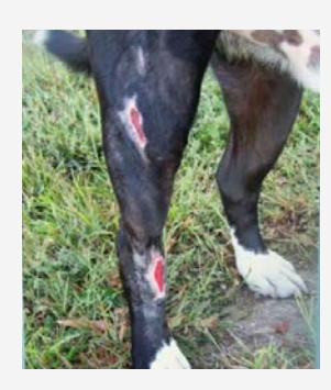
Rosco is nearly healed and happy!